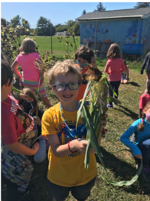
Students celebrated with our first CEC Corn Roast