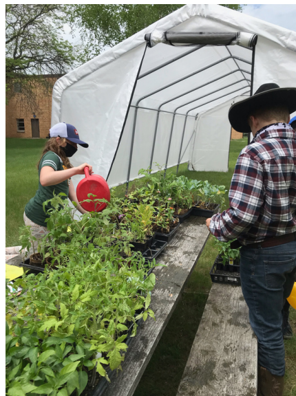
Greenhouse purchased with Rotary Youth Grant Funds